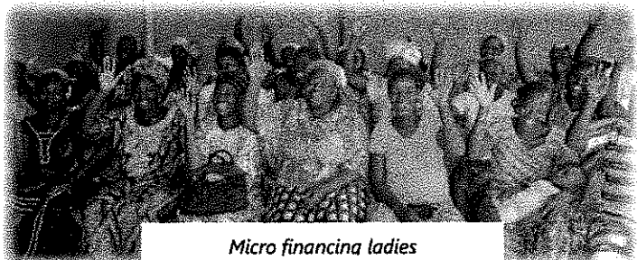
Micro financina ladies